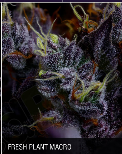
FRESH PLANT MACRO