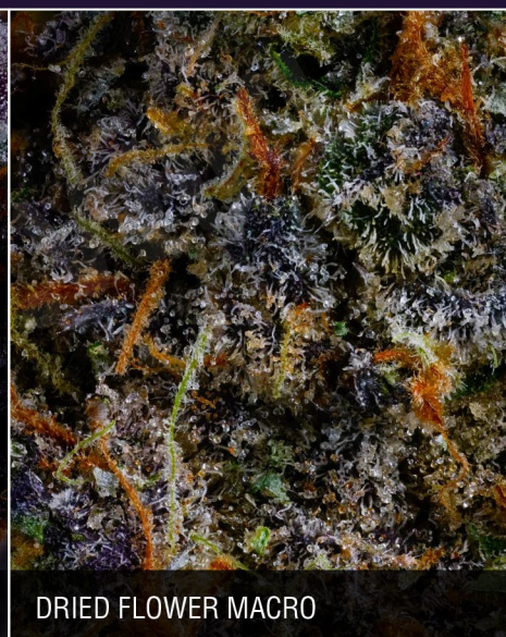
DRIED FLOWER MACRO

CULTIVATION: LIVING ORGANIC SOIL / BRITISH COLUMBIA, CANADA