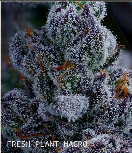
FRESH PLANT MACRO